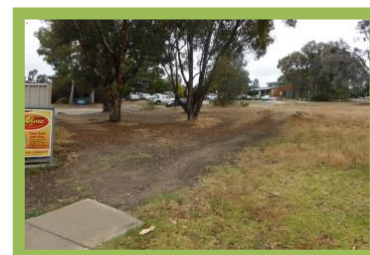
School in the distance – no path!

Victory College: Already a keen supporter of active travel, are looking to map and publicise preferred routes to school.