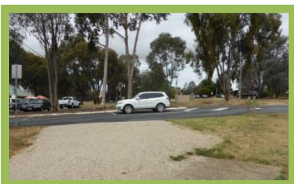
A path to nowhere! No crossing point.

Participants were provided an overview of Walking Maps and the opportunity to explore all its features and functions. Students enjoyed using the technology and they quickly managed to create a practice route of their own design.