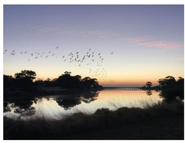
Laverton Creek bridge and saltmarshes

Creation of a landmark walk in Melbourne's west would increase the potential to attract visitors and build community pride in the area.