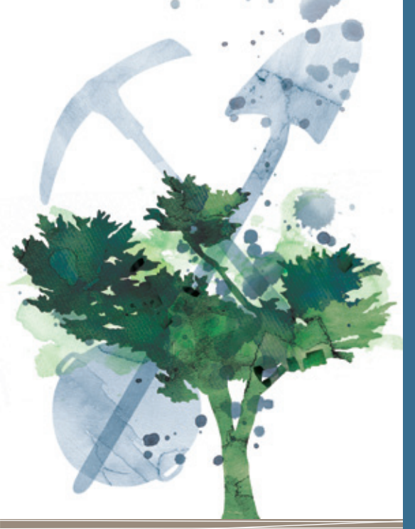
Built on Gold Warrandyte Historic Town Walk